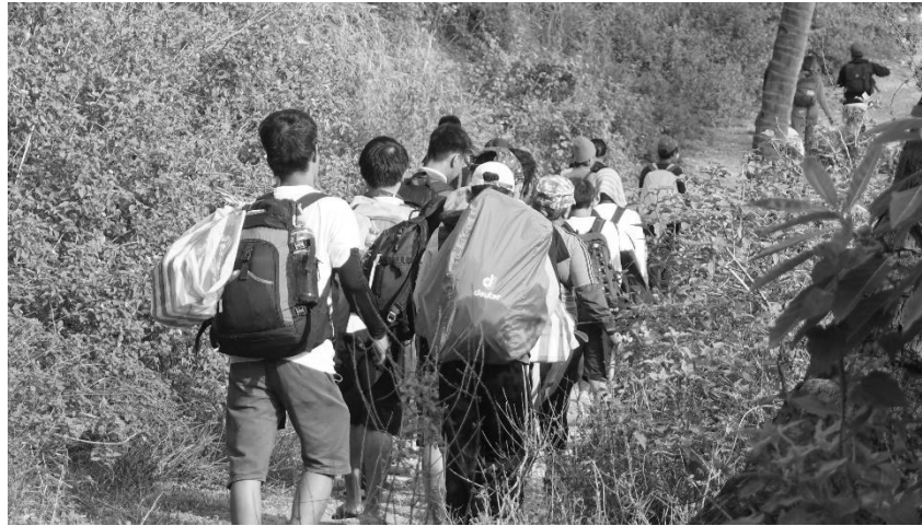
Then, we started the almost 3-hour walk from Apias to MCTV Recudo (our second homebase)

After reaching the Recudo, we had lunch. After that, the other team went to Pandanan, which is another 30-minute walk.