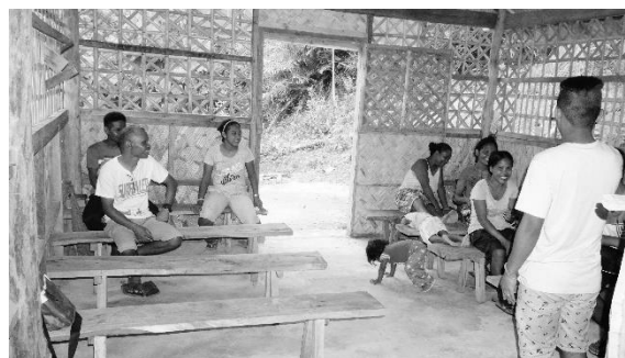
Bible Study inside MCTV Pandanan