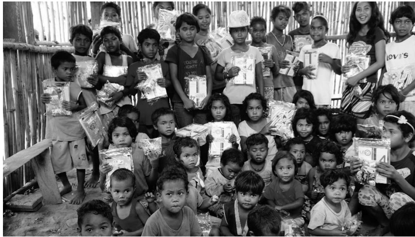
Gift-giving of school supplies for Magnot kids