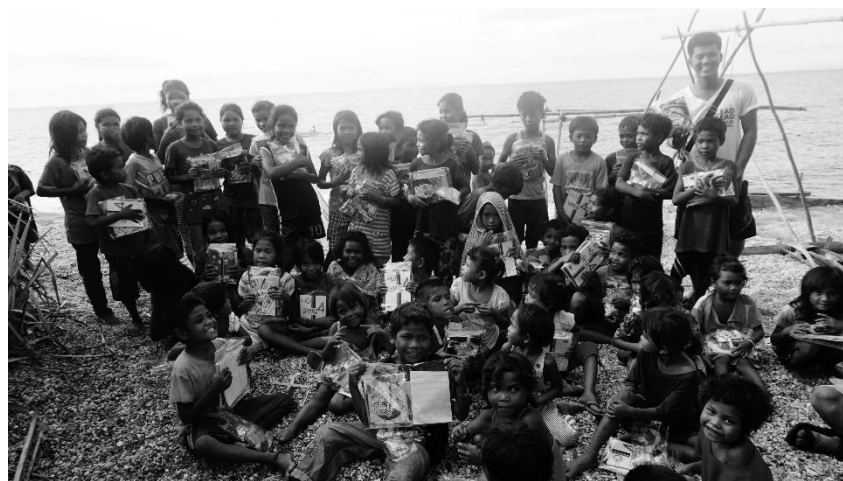
Gift-giving of school supplies for Pandanan kids