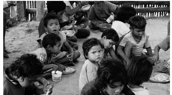
Feeding of Magnot children