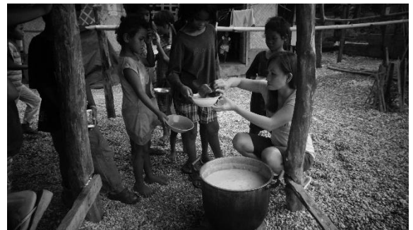
Feeding of Pandanan kids