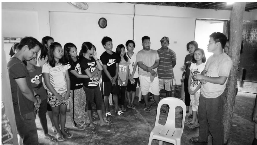
Young people from MCTV Poblacion who attended the seminars