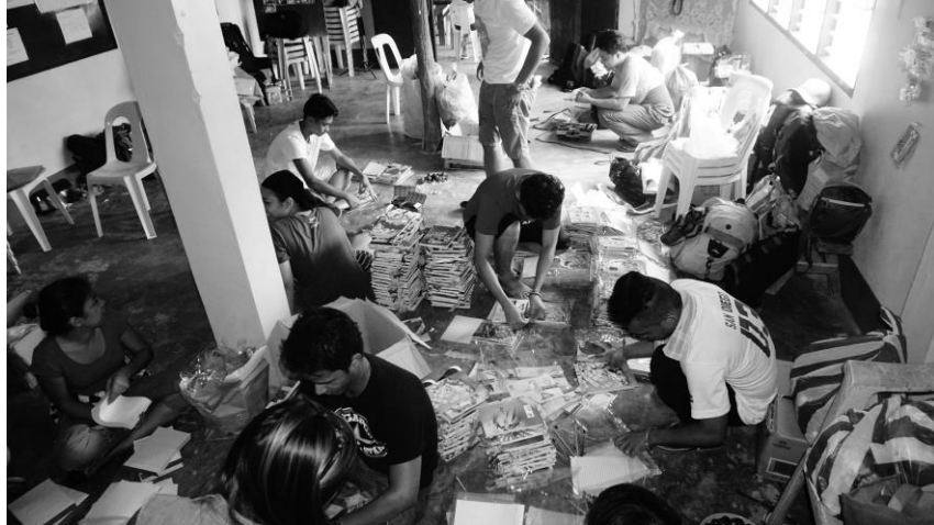
300 sets of school supplies being packed