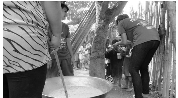
Feeding of Alatin children