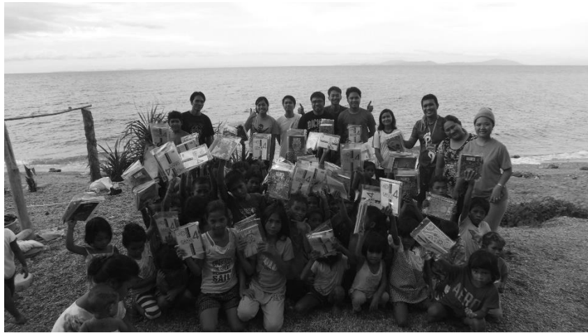
Gift-giving of school supplies for Recudo kids