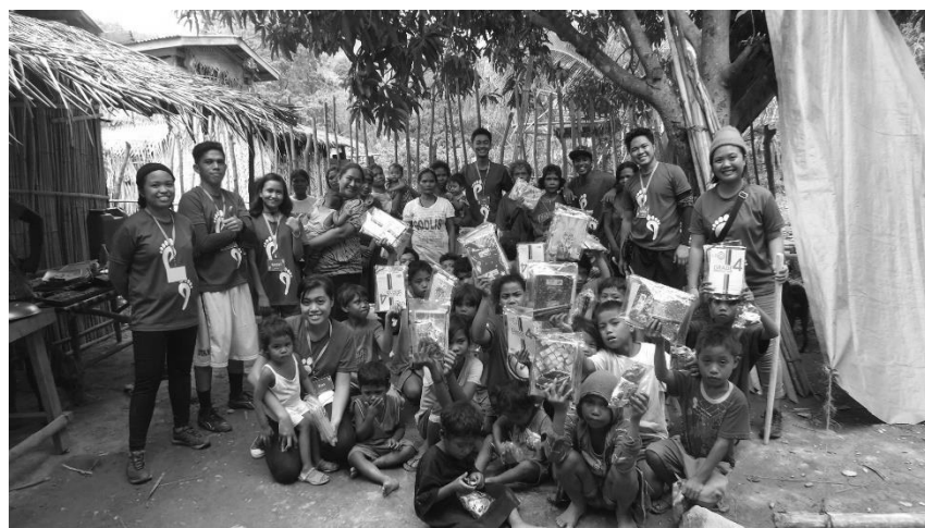
Gift-giving of school supplies for Alatin kids